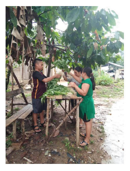
Figure 7 Harvest

However, the reality of the weakened social capital is evident from the difficulty in raising the community to carry out activities for the common good. This research found that the root of the weakening of social capital in Kobeng Hamlet is the envy because it is accustomed to living communally with levels of welfare and education that are more or less the same for generations.