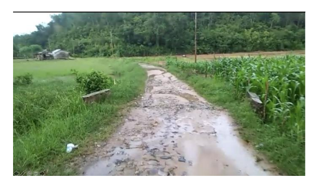
Figure 2 Farms in Kobeng

In general, the Kobeng community are Dayaks. The Dayak community is known as a community that lives communally, because since a long time ago they lived in togetherness and close brotherhood. Thus, the potential for social capital among the Dayaks is also large because in a communal community there are certainly important elements in social capital, namely social networks, mutual trust, and norms or values that are shared. However, every time the Headman invites the community to gather together to do various things in the common interest, it is very rare that people want to come. This shows their weakened social capital. Everyone only thinks about their own interests and does not care about the common interests.