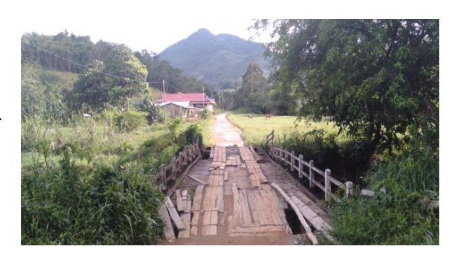
Figure 1 The bridge to Kobeng and Bukit Jamur as the background

Kobeng is the name of a hamlet located in Bengkayang Regency, West Kalimantan. Actually the location of Kobeng provides many opportunities for the community to be able to advance economically. First, the location of the village is located at the foot of Bukit Jamur, a well-known tourism site in Bengkayang. In addition, Bengkayang Regency is a border area directly adjacent to Malaysia. This should provide benefits in cross-border business matters. However, the reality is that the people who live in Kobeng Hamlet do not experience economic prosperity either because of tourism or cross-border business. Most of them are farmers. The crops planted are rice which is harvested once a year. In addition, they also grow corn, but the amount of production is not much. In the field of farming, people still do it more manually than using machines. Their agricultural system can still be considered traditional so that its influence on the economy of the local community is insignificant.