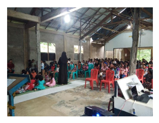
Figure 8 Praying together in the church

Thus, another root of the weakening of social capital in Kobeng Hamlet is also the weakening of spiritual capital. If people have a united heart in their spiritual appreciation, there will be strengthening of spiritual capital. From this will flow a social capital because they live together by living the same norms.