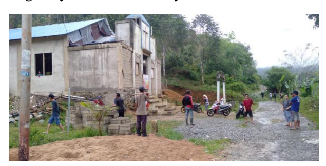
Figure 4 Situation of Kobeng

Since that incident, Kobeng Hamlet has become an empty hamlet because there are no residents left. In the mountainous area next to the Kobeng Hamlet, there is a village called Teluk Bayur which is inhabited by Dayaks. Seeing that the Kobeng Hamlet was empty and unoccupied, the Dayaks who lived in Teluk Bayur immediately went down the mountain and changed the name of the Sampokjio Hamlet to Kobeng Hamlet, which means the Chinese Rice Barn. The background of the name is because in the empty village there was rice barn left by the owner. Thus, now the hamlet has changed its name from Sampokjio to Kobeng Hamlet and its inhabitants have also changed from what was originally Chinese, now Dayaks.