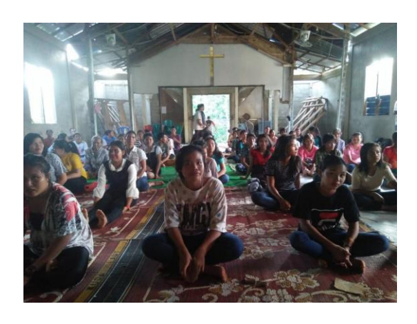
Figure 3 People of Kobeng